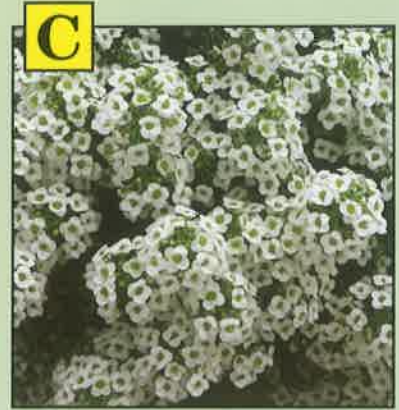
C Alyssum White Dainty pure white flowers cover low growing plants to create a beautiful carpet of snow. Excellent border plants.