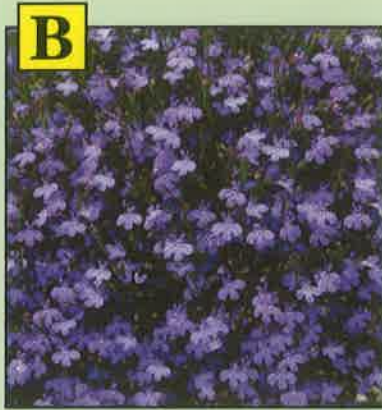
B Lobelia Blue Lobelia produces thousands of brilliant blue flowers on low-growing 4"- 6" plants. Perfect for rock gardens, borders and pots.