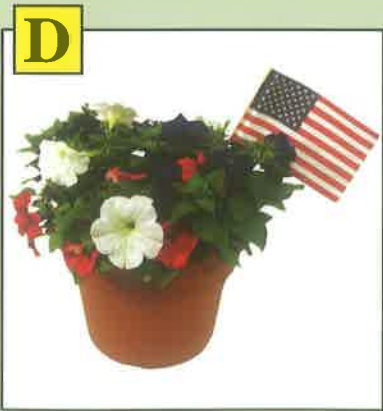
D Fallen Hero Memorial Day planter Red, white and blue petunias in a 10 inch container. (To donate this product to a Veterans Cemetery see Hanging Basket brochure #7)