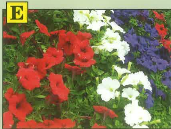
E Petunia Mix These petunias bloom like crazy all summer long. We're nuts about these petunias and we think you will be too! Plants do best in full sun. Also available but not shown: F Petunia Red G Petunia White H Petunia Blue