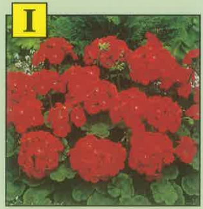
I Geranium Hybrid Red Our hybrid red geraniums keep blooming and growing all season long. Plants grow 12"-14" tall. 14 - 4 inch pots. J Geranium Hybrid White Also available but not shown.