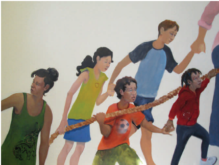
The mural in process.