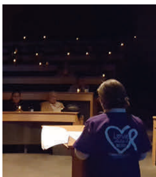
Candles shine during the vigil for those who did not survive domestic violence.

Other events for the month included a presence at area libraries and a panel presentation led by Kane County Sheriff Donald E. Kramer.